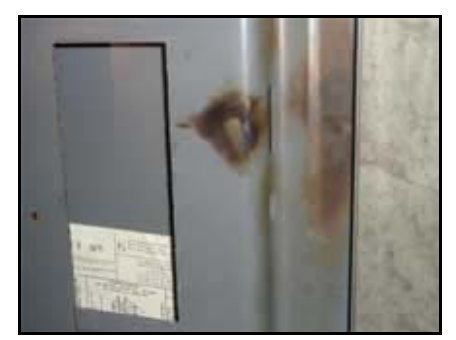
This is another panel with soot inside. There was a blown out breaker in this panel.

This panel was one of the most dangerous ones we have seen yet. I knew it would be a mess when we saw the seller had painted the enclosure a nice clean silver. It was full of soot and charred wires.